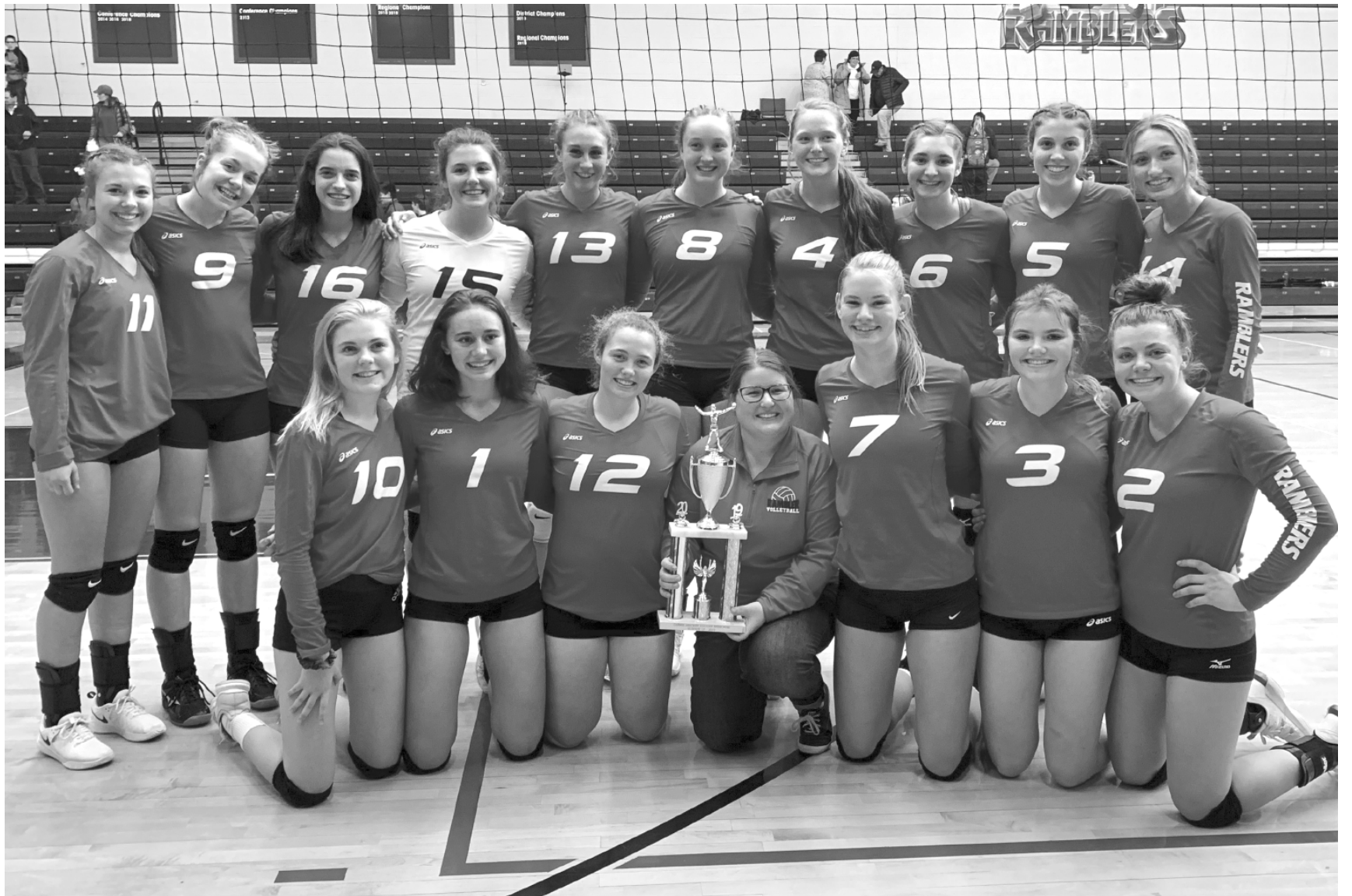
Boyne City poses with the second place trophy from their own Carrie Bricker-Hauger Memorial tournament.

The Rayders went 3-5 in pool play, falling to East Jordan 25-27, 18-25; beating Har-