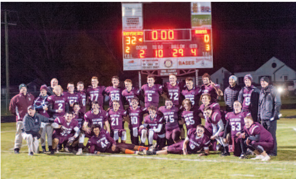
The Charlevoix football team and coaching staff pose for photos after their district playoff win over Harbor Springs.